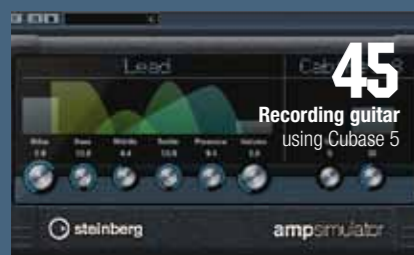
45 Recording guitar using Cubase 5