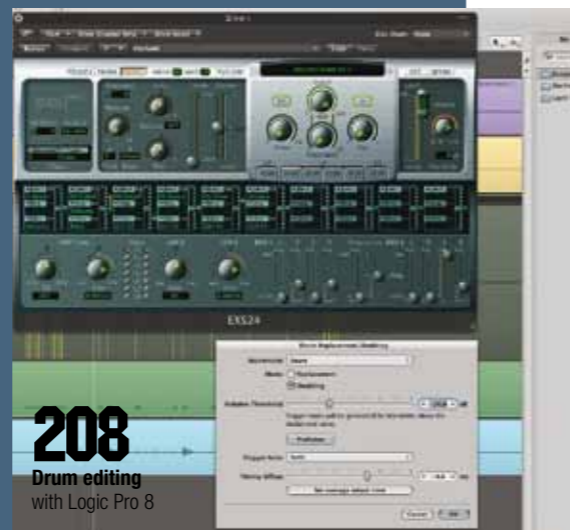
208 Drum editing with Logic Pro 8