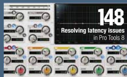
148 Resolving latency issues in Pro Tools 8