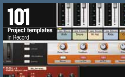
101 Project templates in Record