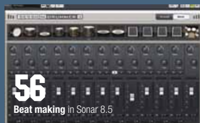
56 Beat making in Sonar 8.5