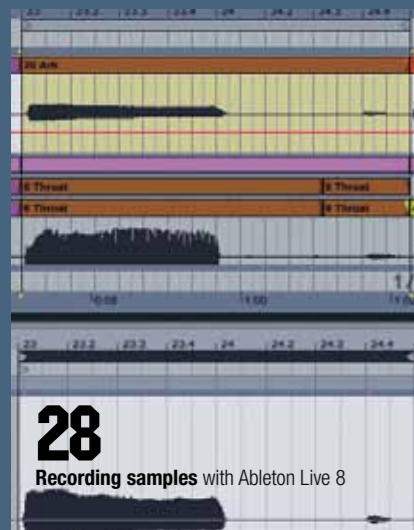
28 Recording samples with Ableton Live 8