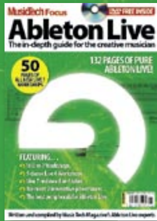
Music Tech Focus Ableton Live

ON YOUR MusicTech DVD Turn to page 130 to find out what's on this issue's Music Tech Focus DVD.